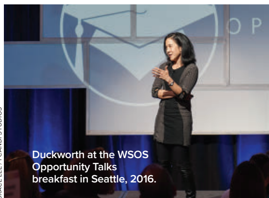
GRACE LEE / I CANDI STUDIOS