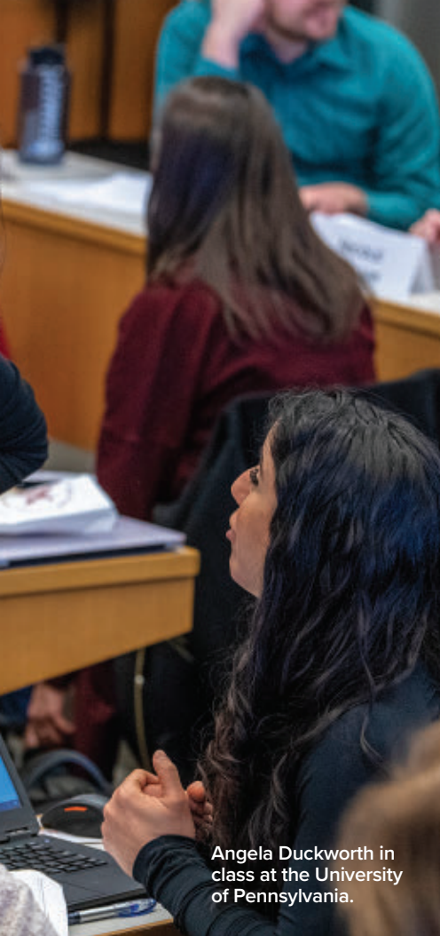
Angela Duckworth in class at the University of Pennsylvania.